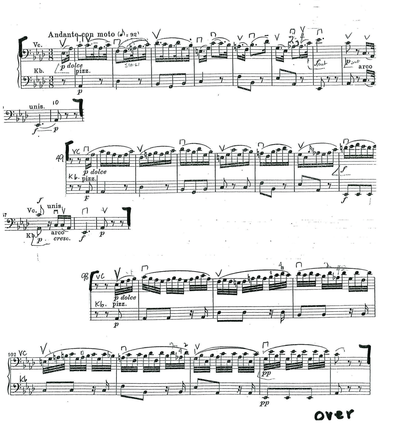
Beethoven: Symphony No. 5, Movement 2 Opening to M. 10, Mm. 49-59, M.s 98-106 and Mm. 114-124 Cello